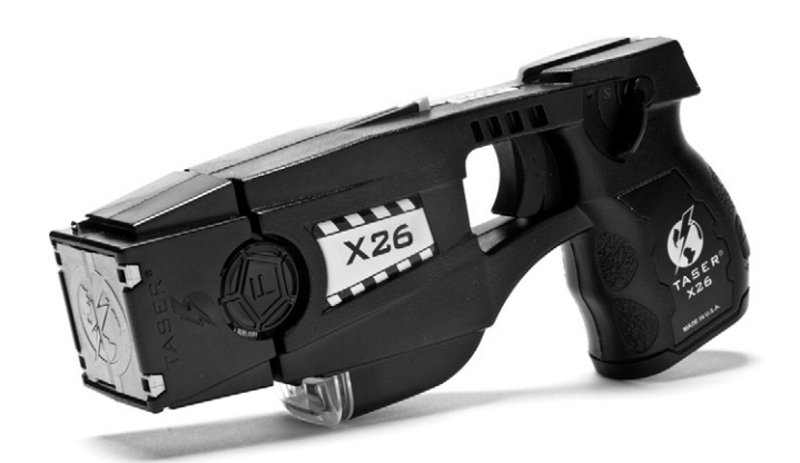
Figure 1. The Taser model X-26 conducted electrical weapon.

Controlled studies of the cardiac and physiologic effects and risks of conducted electrical weapons in animals and healthy human volunteers have begun to address the topic of conducted electrical weapon safety. However, these studies may not accurately reflect risks among criminal suspects in whom coexisting medical and psychiatric conditions, alcohol and drug use, and other factors are often present. These factors may increase risk in this population and make epidemiologic investigations during actual use critical to provide a realistic risk assessment of these weapons. We performed the first large multicenter study to determine the incidence of injuries and adverse outcomes after law enforcement use of conducted electrical weapons.